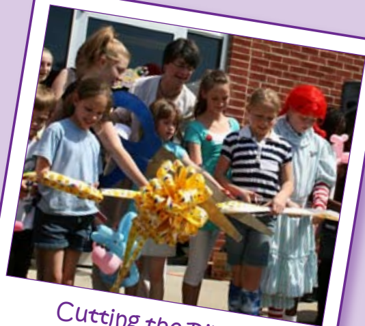
Cutting the Ribbon at Smiles Central

Thanks to everyone for our very successful Open House on April 25 at our new office and warehouse at 3303 North Sixth Street in Harrisburg, PA. It was attended by approximately 350 friends, neighbors and volunteers and was staffed by about 50 volunteers. The event included Shriner's clowns, clowns on stilts, balloon animals, bag decorating, office tours, art contests, Susquehanna Rescue Fire trucks, LOTS of great food donated by local restaurants and businesses, great volunteers and board members staffing booths, fantastic silent auction items, and much more. A special thanks to Lisa Bleiweiss and Nichole Murlin for coordinating the Open House efforts.