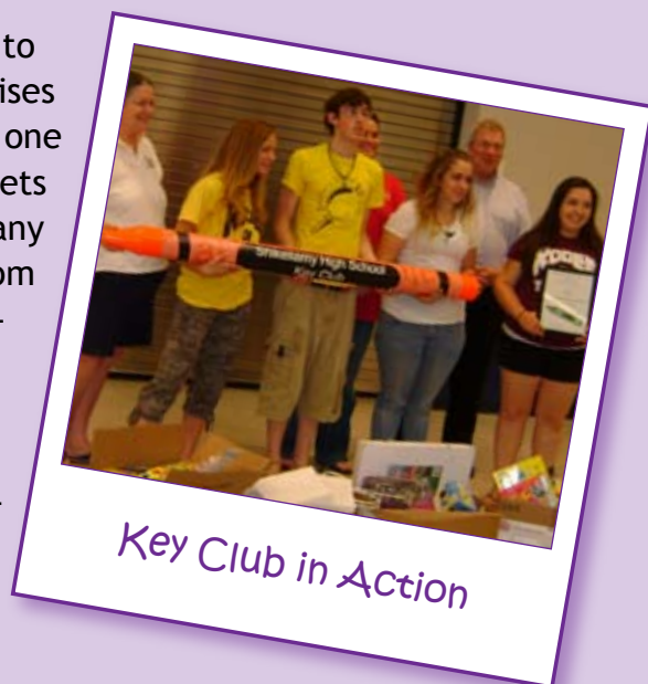
Key Club in Action

Key Club, and the entire Kiwanis Family, is proud to support the Caitlin's Smiles program! We look forward to many more successful projects and fundraisers to continue to help bring smiles to the faces of children!